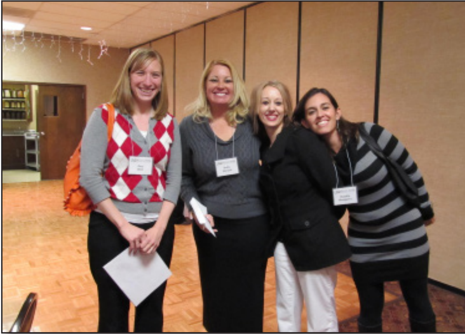
(Distance MSW Foundation Students)